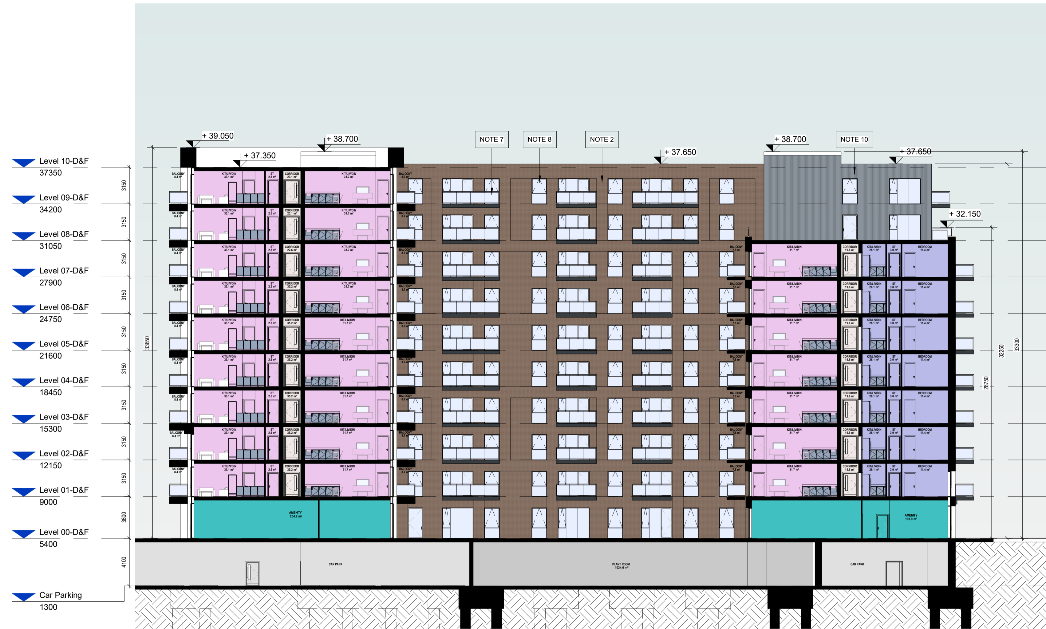
1 BLOCK D-SECTION F-F 1:200